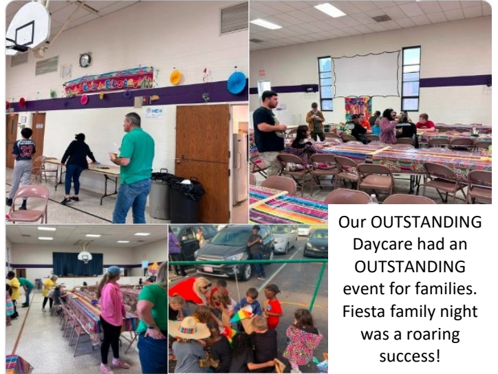
Our OUTSTANDING Daycare had an OUTSTANDING event for families. Fiesta family night was a roaring success!