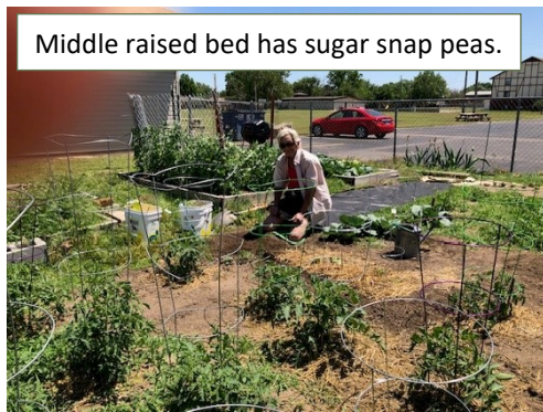
Middle raised bed has sugar snap peas.