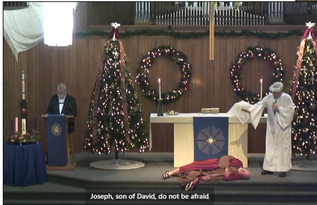
Joseph, son of David, do not be afraid