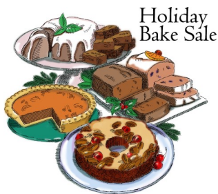
Holiday Bake Sale

Bring gently used items and baked items on Saturday, the 3rd or on Sunday, the 4th. Place gently used in activity center and baked goods in kitchen. All will be for freewill donations. And all donations will go for LWML Mites which are used for grants.