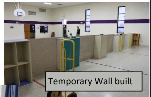
Temporary Wall built