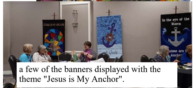
a few of the banners displayed with the theme "Jesus is My Anchor".